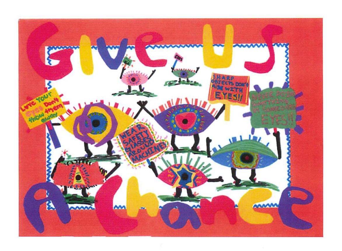
Protect Your Octopies