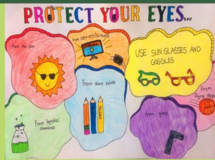
2nd Place – Jaya Simmons Sherwood Lodge #2342 North Central District